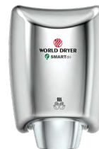
SMARTdri® Energy-efficient sensor hand dryer