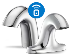
Serio® Series Connected faucets