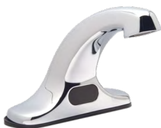
Z6915-XL AquaSense® sensor faucet