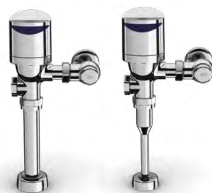
EZ Gear Technology Sensor flush valve