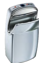
VMax® V2 HEPA-filtered vertical sensor hand dryer