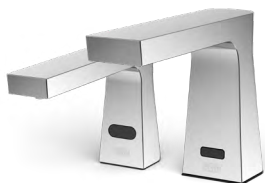
EZ Gear Technology Sensor faucet and soap dispenser