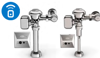
ZEMS6000 AquaSense® connected flush valve