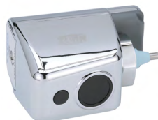
ZERK E-Z Flush® retrofit kit