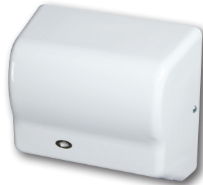
Steel White Epoxy