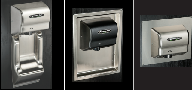
ADA-WG WALL GUARD