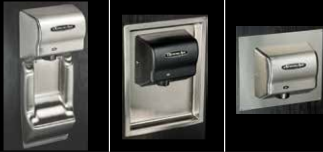
ADA-WG WALL GUARD