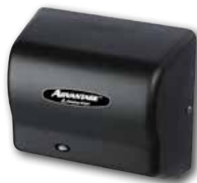
Steel Black Epoxy