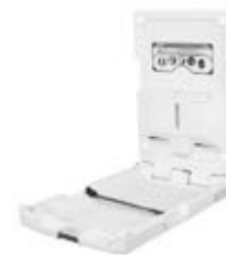
White Polyethylene Vertical