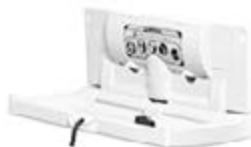
White Polyethylene Horizontal