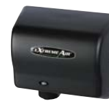
Steel Black Epoxy