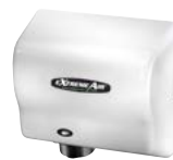
Steel White Epoxy